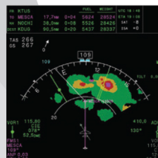
Nav Display with 120° Map View and Radar